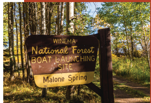
Malone Springs Day Use Area