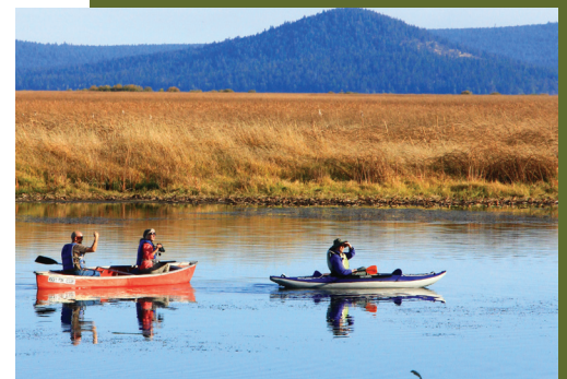
Spotting Wildlife on Canoe Trail

Find information, route maps, and more tours at DiscoverKlamath.com/Self-Guided-Tours