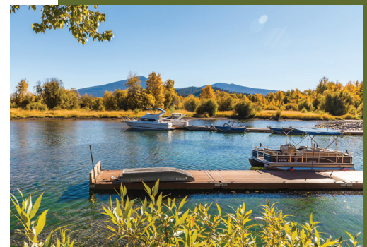
Harriman Springs Resort

Sky Lakes Wilderness Adventures 112 W Chocktoot St Chiloquin, OR 97624 541-591-0949