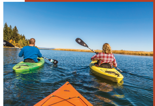
Kayaking on the Canoe Trail

Find information, route maps, and more tours at DiscoverKlamath.com/Self-Guided-Tours