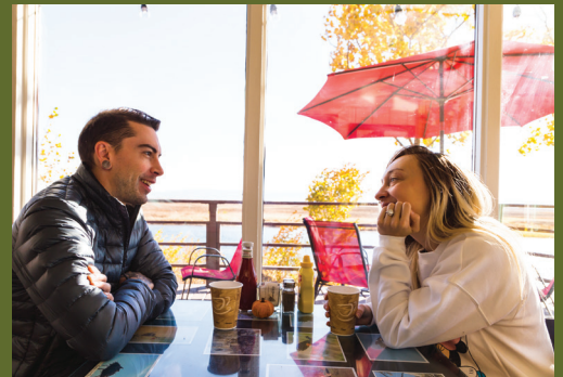
Rocky Point Resort